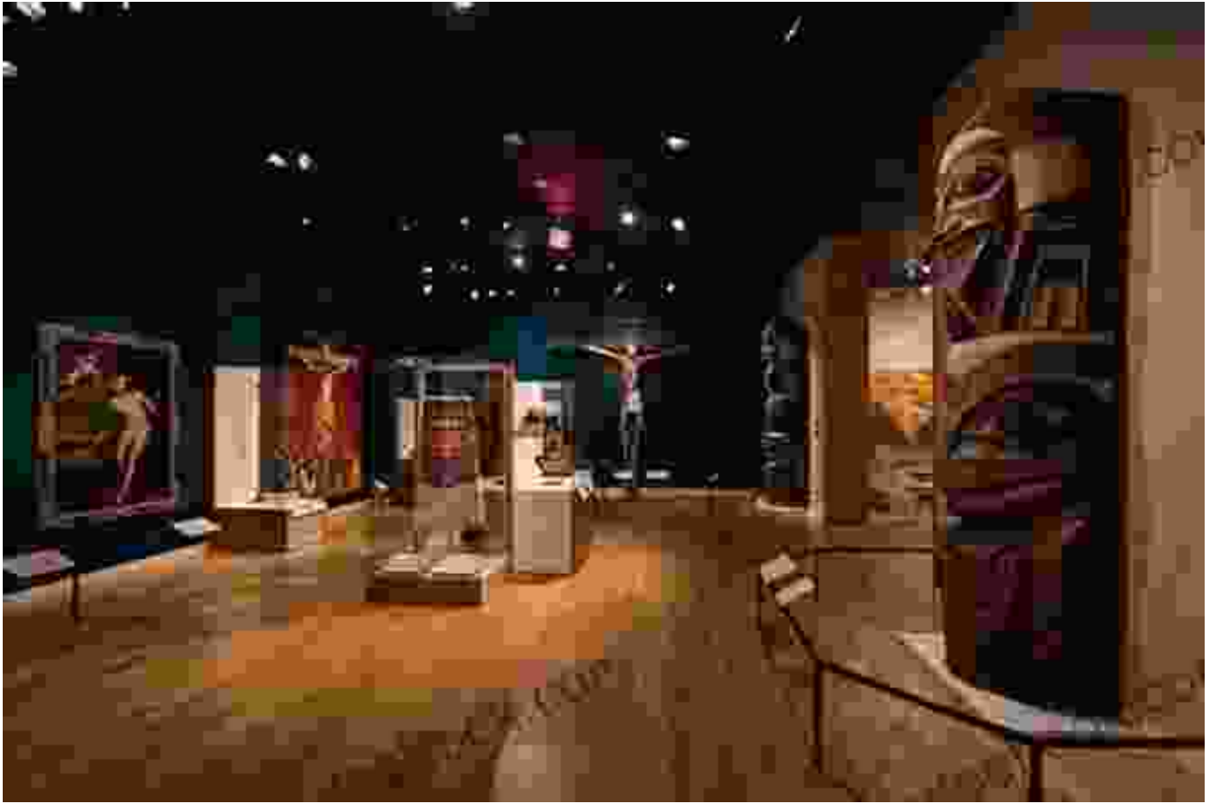
The Autry Museum of the American West in Los Angeles