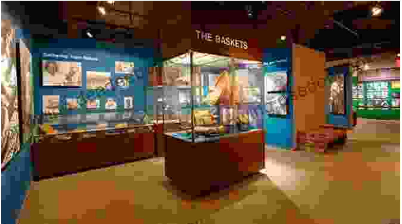
The California Indian Museum and Cultural Center in Sacramento