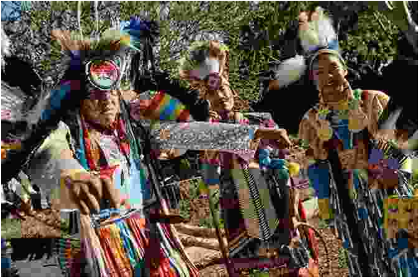
A group of indigenous people of California in traditional clothing