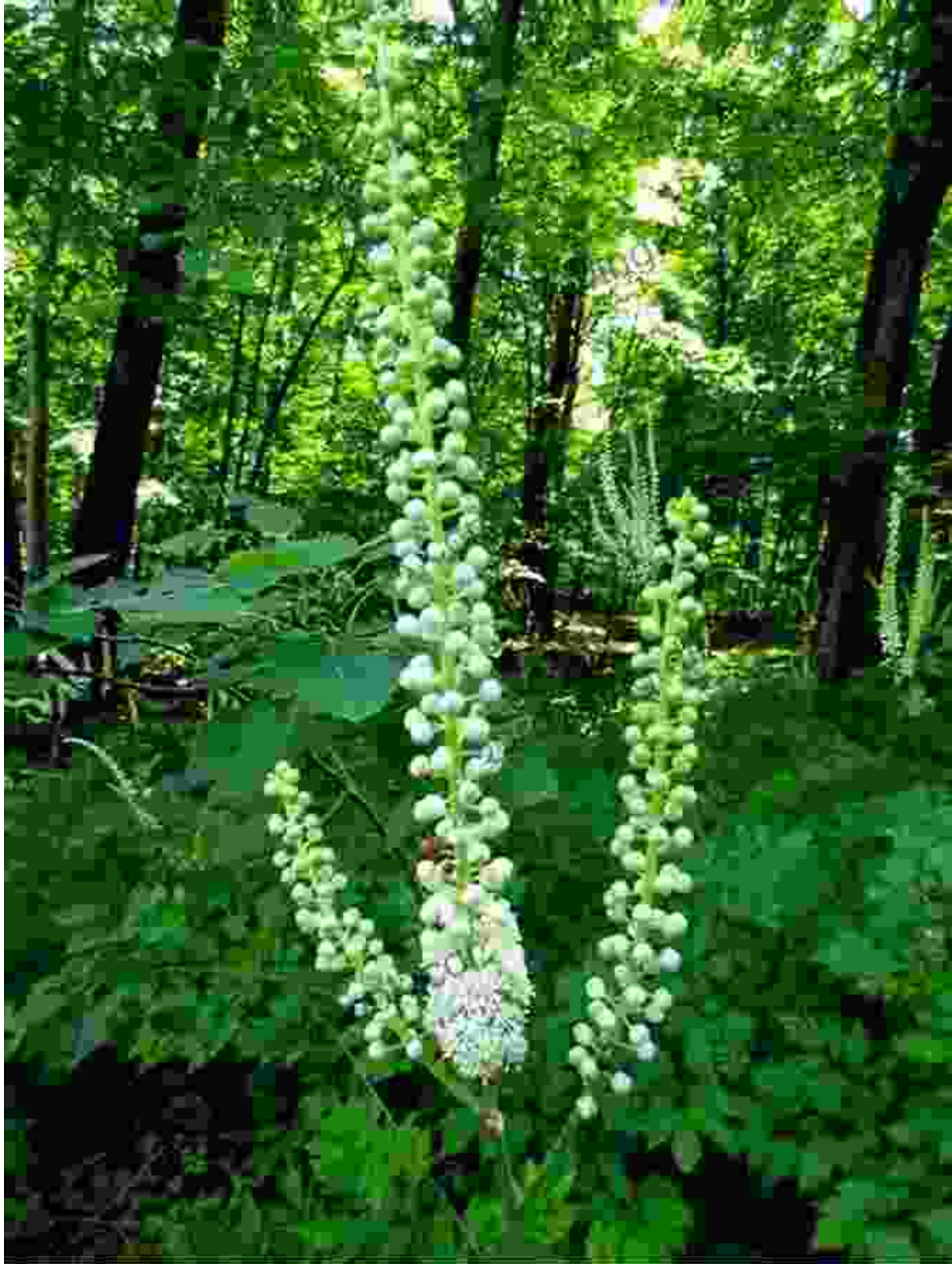
Black Cohosh ( Actaea racemosa )