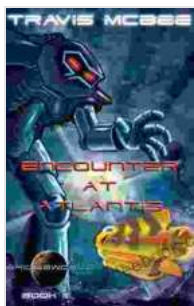
Image 4 (Alt: The explorers encounter the Guardian of Atlantis, a powerful cosmic entity that protects the world's secrets)

Image 3 (Alt: Ancient texts written in an unknown script, discovered in the library of Atlantis Bridgeworld)