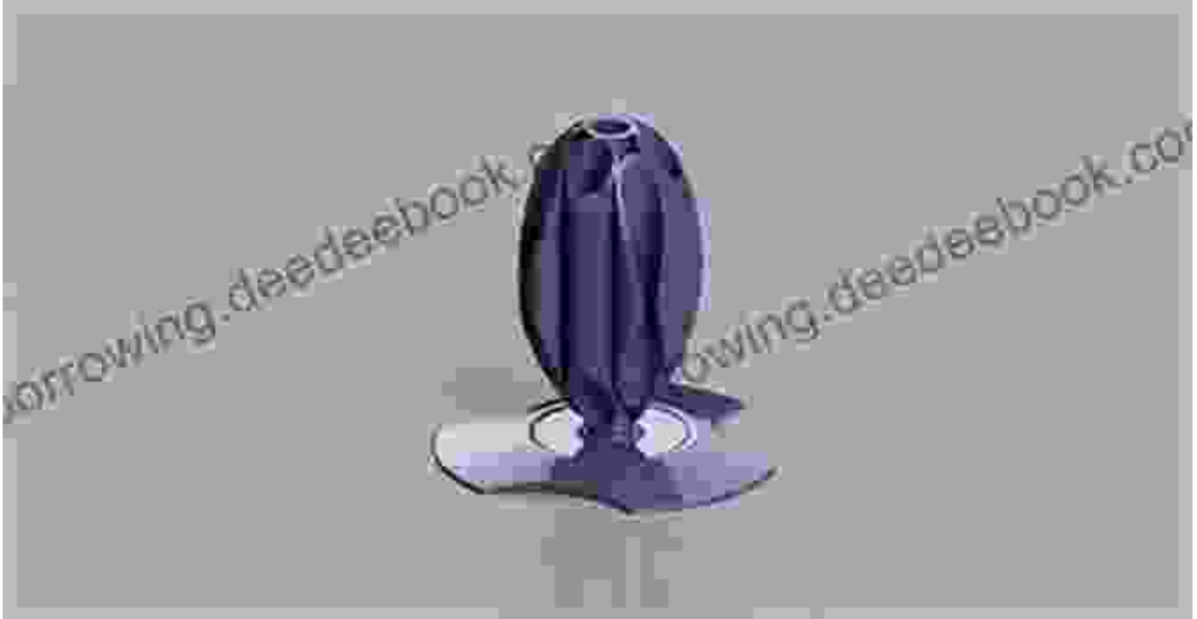
Kay Carter, Untitled, 2019. Aluminum, 30 x 15 inches.