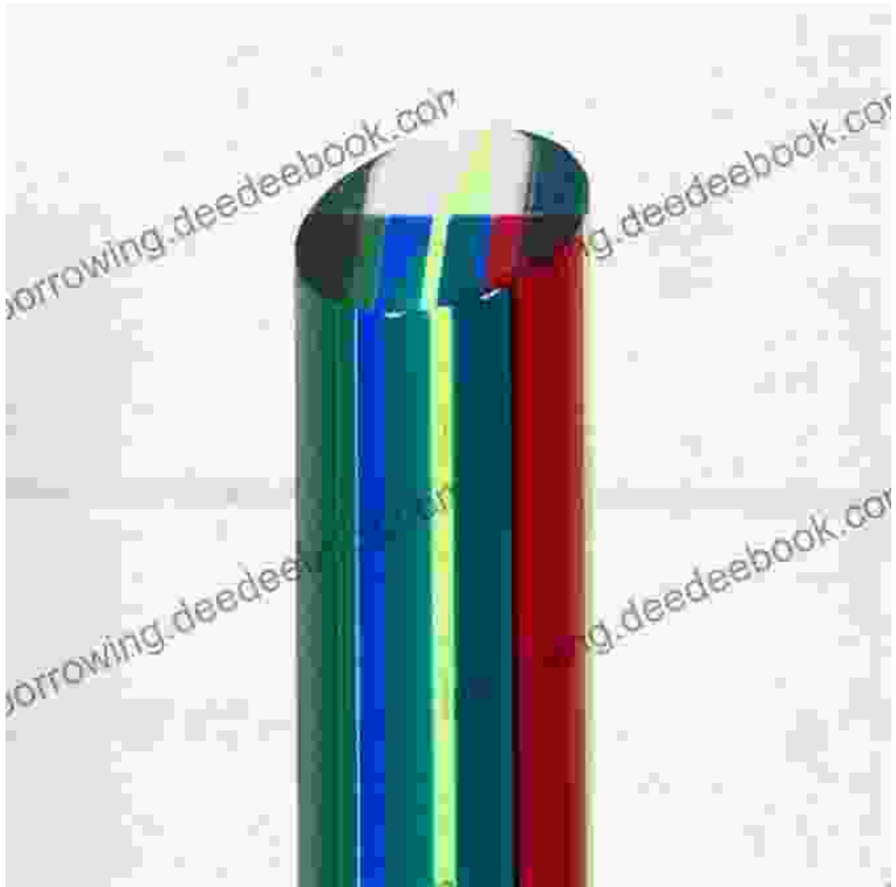
Kay Carter, Untitled, 2021. Aluminum, 24 x 10 inches.