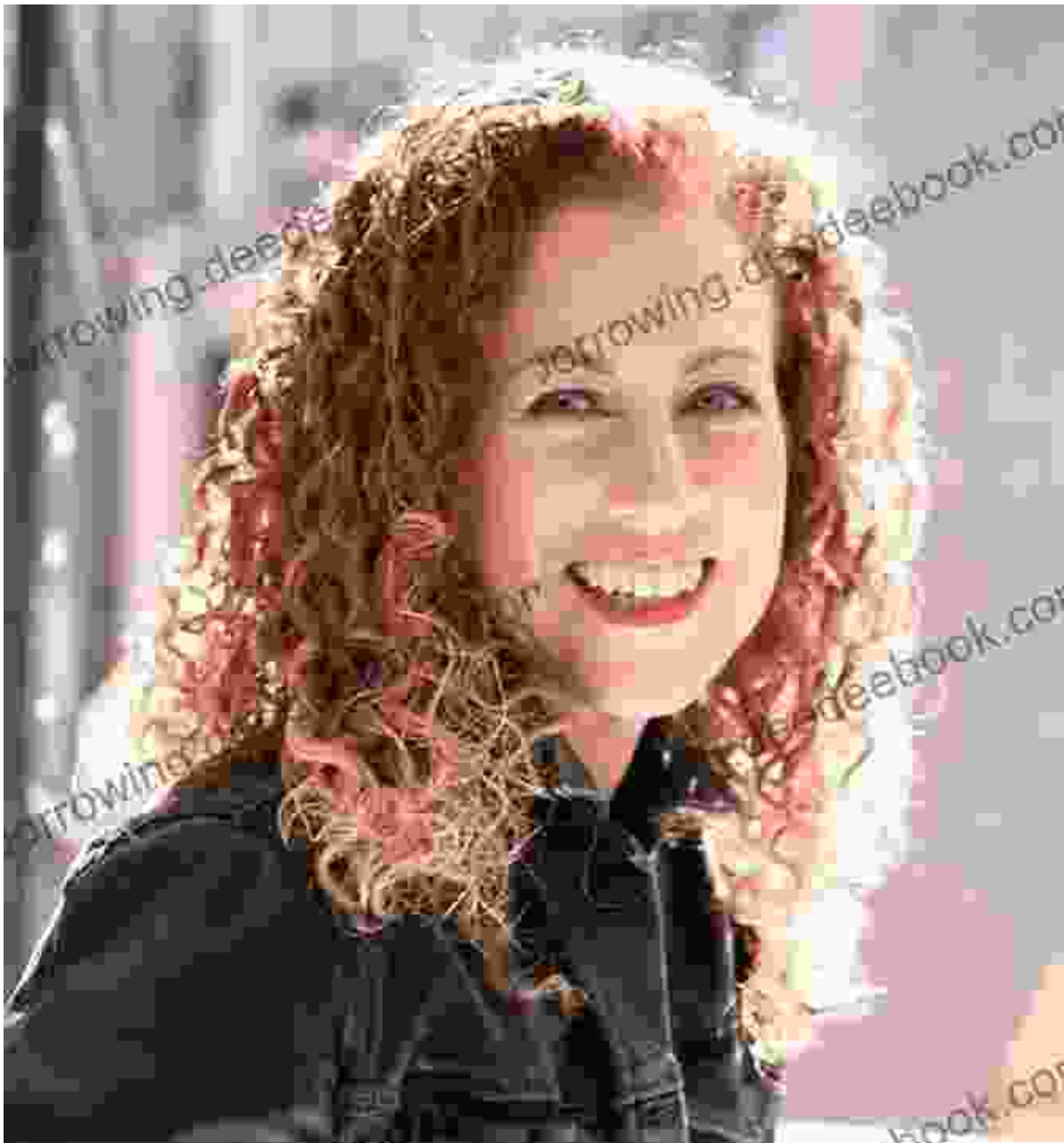
Jodi Picoult author photo