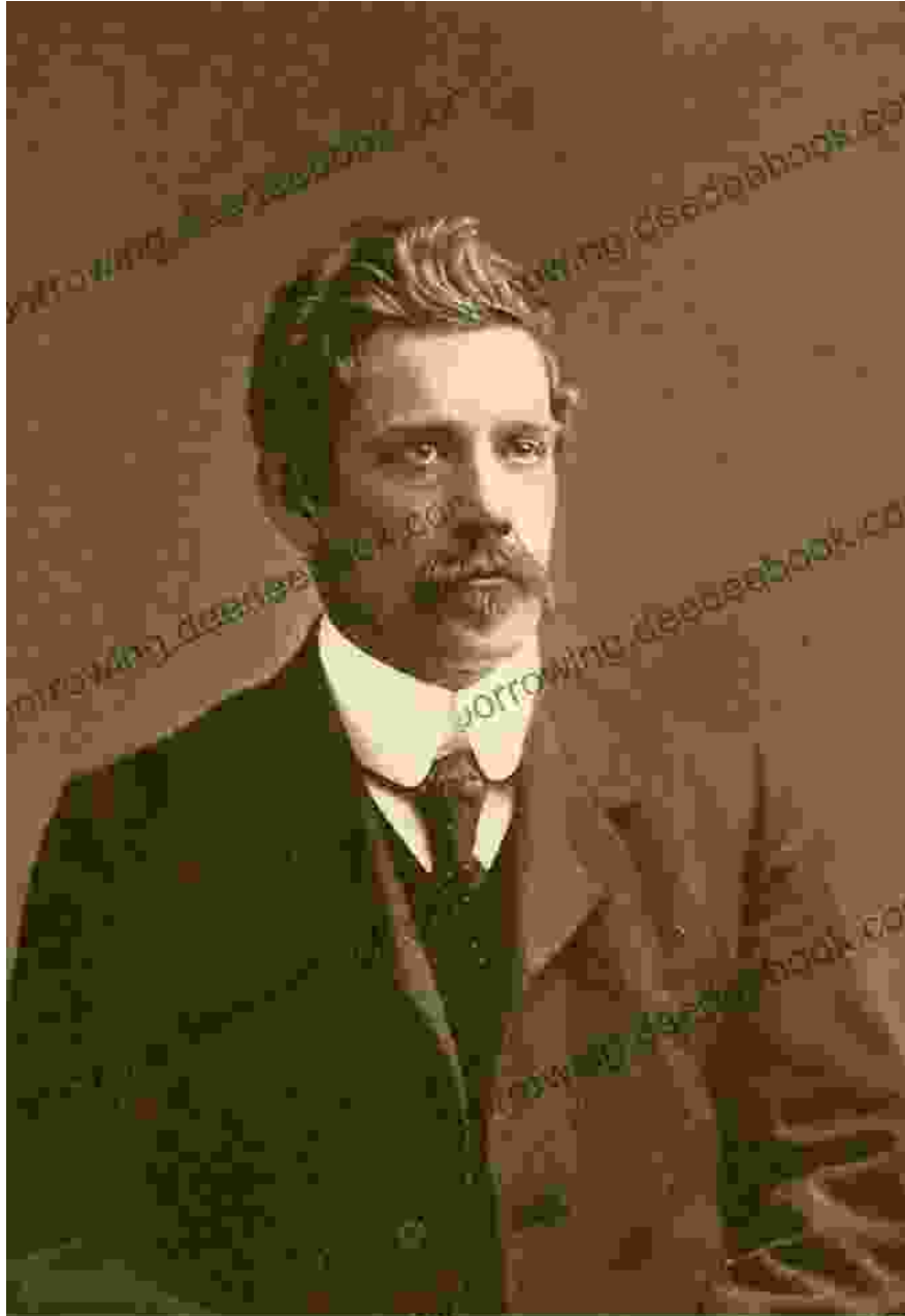
William Butler Yeats

language, and culture. They are characterized by their poetic language, tragic themes, and sympathetic portrayal of ordinary people. His masterpiece, "The Playboy of the Western World," is a celebrated example of Irish theater.